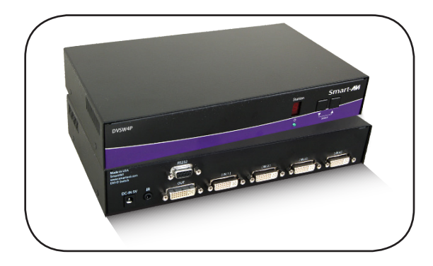
Display Content From 4 Computers, PC or Mac on one Display Up To 20 Feet Away

4-Port Cross-platform DVI-D with RS-232 and IR Control