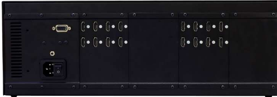
HDR 8x8 Back