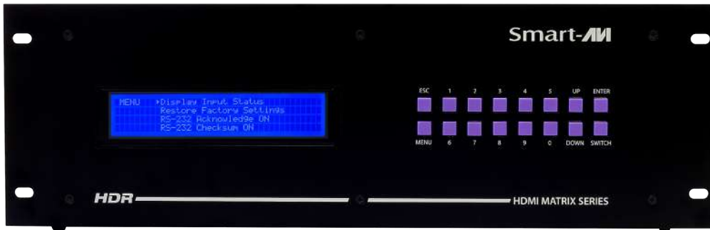
HDR 8x8 Front