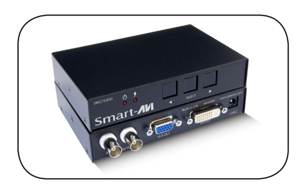
VGA to DVI-D Converter

Smart AUDIO VIDEO INNOVATION SmartAVI, Inc. / Twitter: smartavi 2840 N. Naomi Ave. Burbank, CA 91504