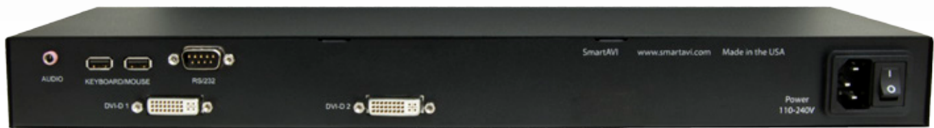
FDX-M2U Receiver Rear