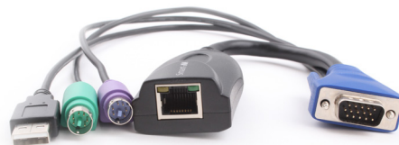
VNETX-CX1 Combined WUXGA KVM Cable over Cat5