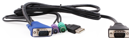
VNET-CB1 Combined KVM Cable