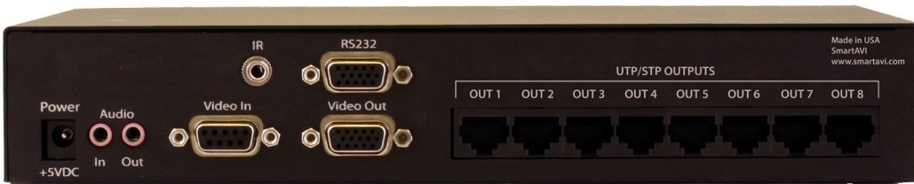
XT-TX800 Back Panel