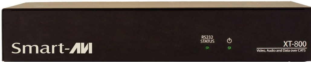
XT-TX800 Front Panel