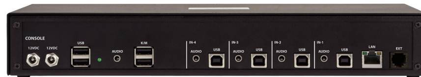
SKM-04-PRO Back Panel