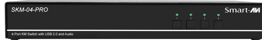
SKM-04-PRO Front Panel