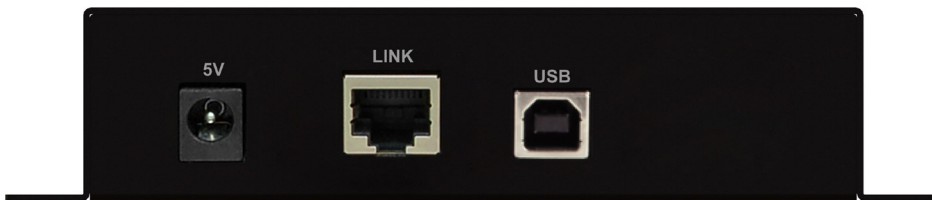
USB2CX-TX Back panel