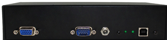
SM-VDX-500-SH-TX Back panel