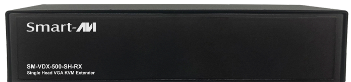
SM-VDX-500-SH-RX Front panel