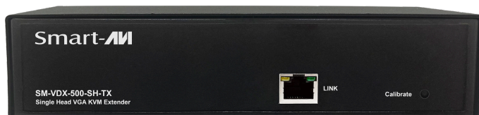
SM-VDX-500-SH-TX Front panel