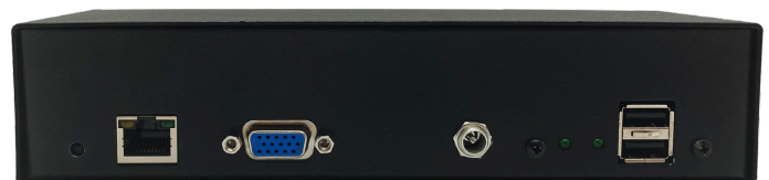
SM-VDX-500-SH-RX Back panel